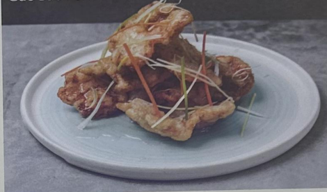
Guo Bao Pork

Chef's Special Taro Duck 香酥芋泥鸭 28 duck cutlet, mashed taro