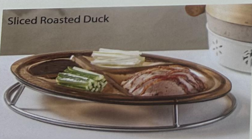
Sliced Roasted Duck

Chef's Special Taro Duck 香酥芋泥鸭 28 duck cutlet, mashed taro