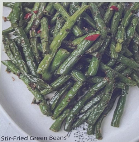
Stir-Fried Green Beans